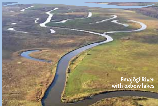
Emajõgi River with oxbow lakes