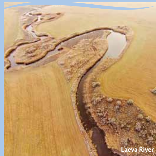
Laeva River

Alam-Pedja Nature Reserve is an extremely valuable region – an intact area of 35,000 ha, making it possible to protect different habitats and thus many animal and plant species. A central connecting element in this area is the Emajõgi River with its tributaries and oxbow lakes. Emajõgi River and its tributaries form migration routes connecting different habitats, while oxbow lakes (over 50 of them) are extremely important breeding and feeding grounds for our fish populations.